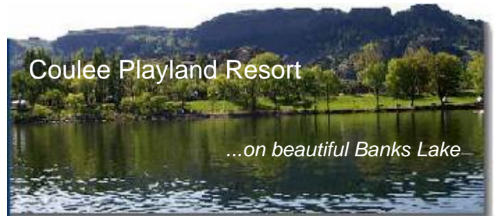
Coulee Playland Resort